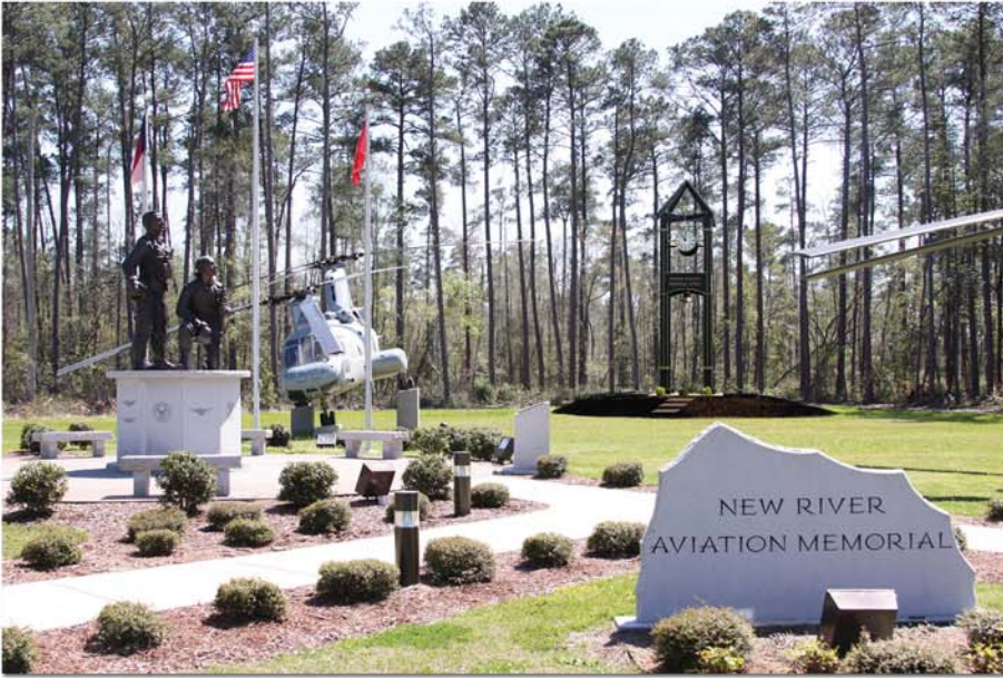
Photo-rendering of the tower on site at MCAS New River.

Sponsors will be recognized at Warrior Night 2010, which takes place at MCAS New River, NC on May 27th, 2010.